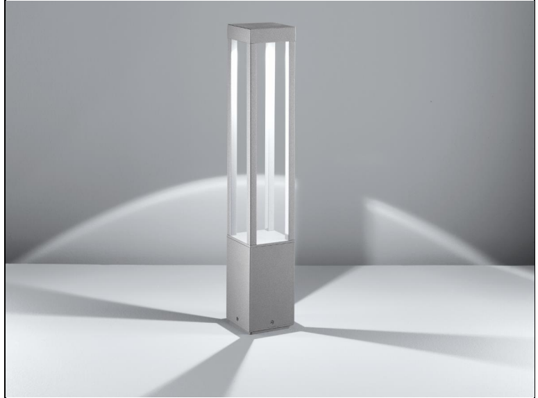
Shown above: DUS827-grey-6W-830-120V/277V-DRV

-120V/277V-DRV Class 2 120V-277Vac 60Hz not dimmable, Power factor ≥ 0.9 / Flicker (THD) ≤ 20%, Constant current 700mA