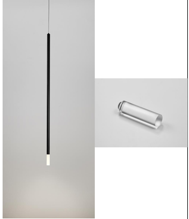
Shown above: DUS756-11-20-05D-2M (SPAGO 60)